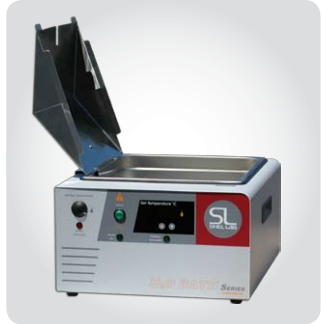
Digital Water Bath W14M

The SHEL LAB high-performance water baths are accurate, easy to use, safe and durable. The water bath design incorporates the attractive SHEL LAB appearance, a drip free cover holster, and pocket handles so users can easily move the water bath's location. A microprocessor achieves precise temperature control regardless of how the unit is loaded. Calibration is performed directly from the front panel.