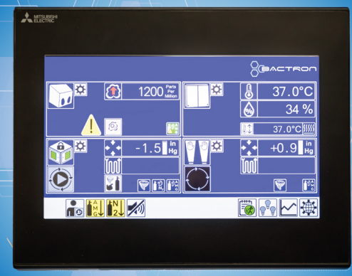
HIGH PERFORMANCE ANAEROBIC CHAMBER